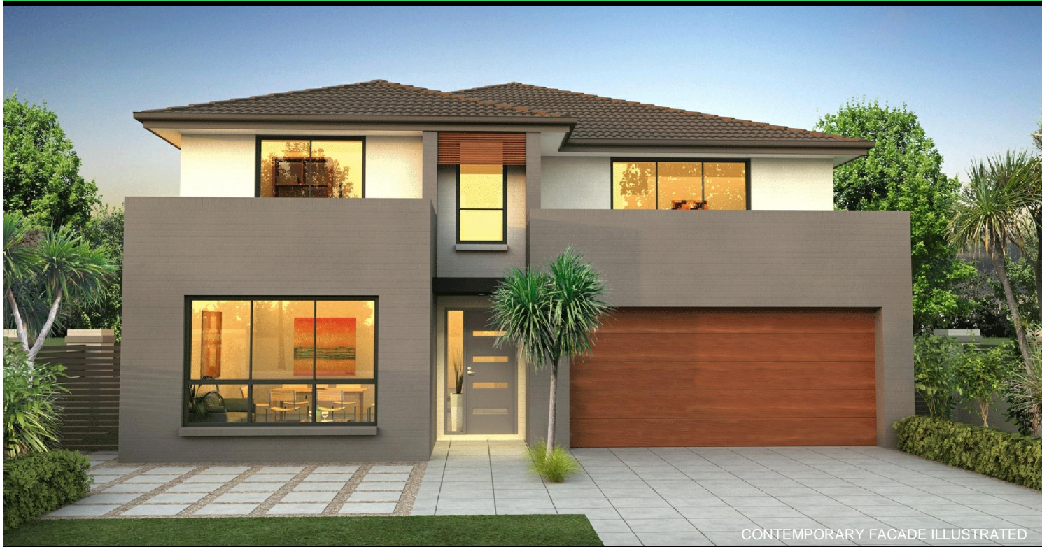
CONTEMPORARY FACADE ILLUSTRATED